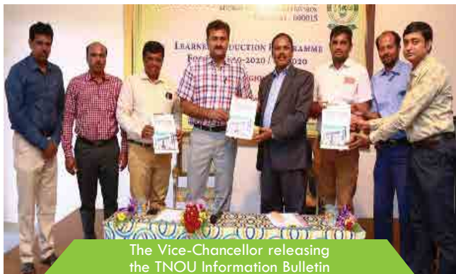
The Vice-Chancellor releasing the TNOU Information Bulletin