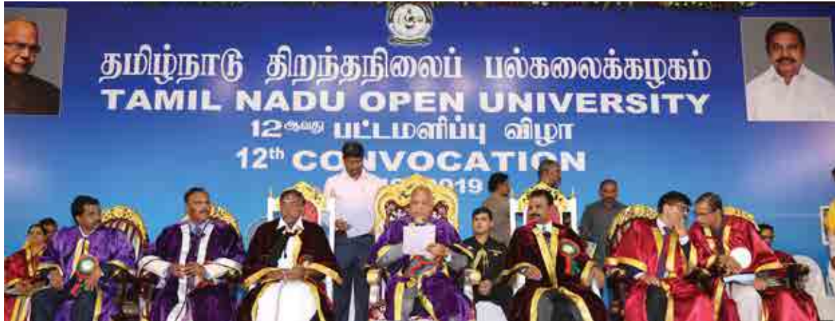
Hon'ble Governor-Chancellor, Hon'ble Minister for Higher Education and Pro-Chancellor, Hon'ble Chief-Guest, Hon'ble Vice-Chancellor and other dignitaries on the dias

The University conducted its 12 th Convocation on 18.10.2019 at Centenary Building, University of Madras. Hon'ble Shri.Banwarilal Purohit, the Governor-Chancellor presided over the convocation. Hon'ble Thiru.K.P.Anbalagan, Minister for Higher Education, Government of Tamil Nadu and Pro-Chancellor of the University delivered the special address. The Chief-Guest of the convocation was Hon'ble Justice Thiru.R.Mahadevan, Judge, Madras High Court, Chennai.