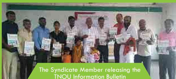
The Syndicate Member releasing the TNOU Information Bulletin