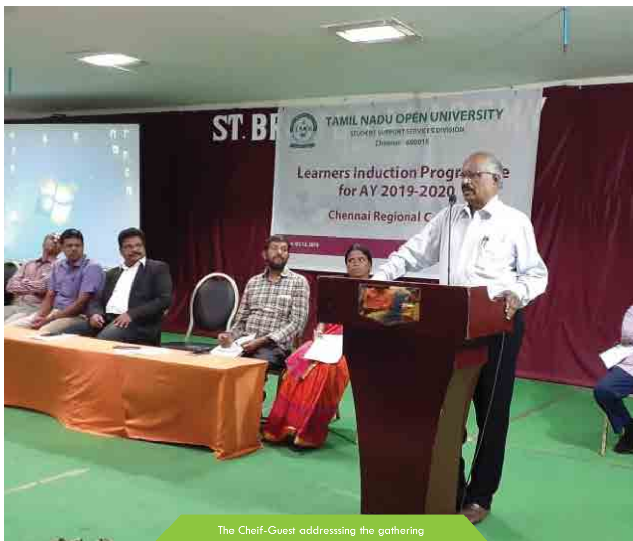
The Chief-Guest addressing the gathering