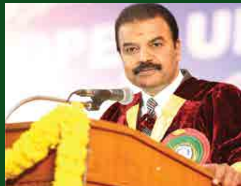
Hon'ble Justice Thiru R. Mahadevan Judge High Court, Chennai, Chief Guest delivering the Convocation Address