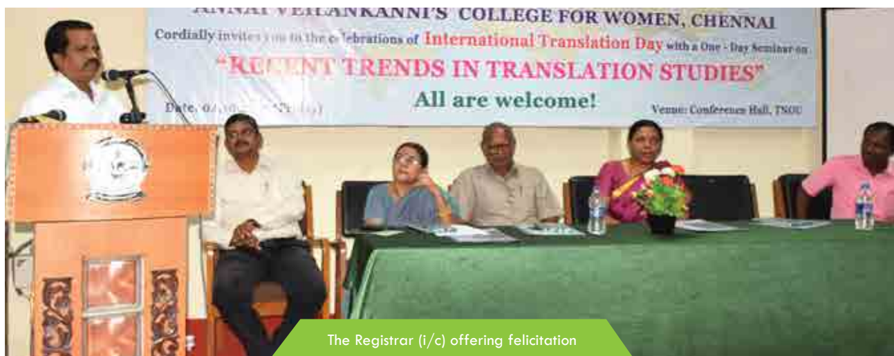
The Registrar (i/c) offering felicitation