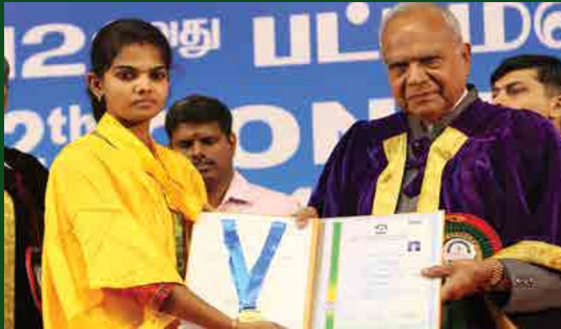
The candidate receiving the Medal and the Degree Certificate from the Hon'ble Governor-Chancellor Banwarilal Purohit