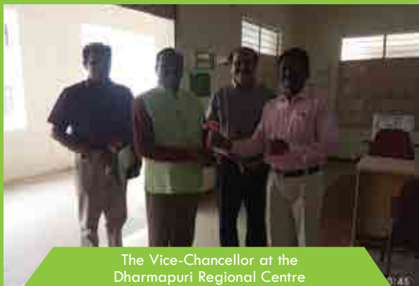
The Vice-Chancellor at the Dharmapuri Regional Centre