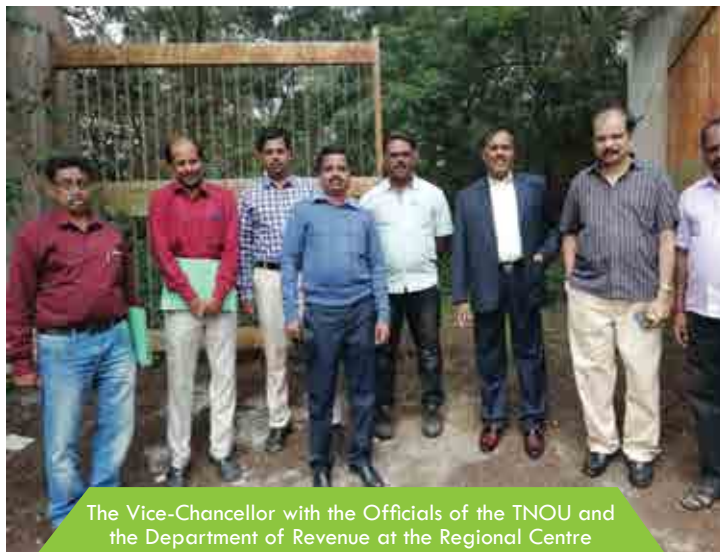
The Vice-Chancellor with the Officials of the TNOU and the Department of Revenue at the Regional Centre