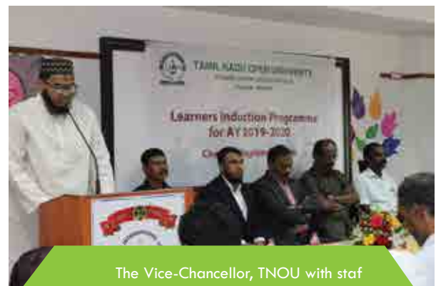
The Vice-Chancellor, TNOU with staf