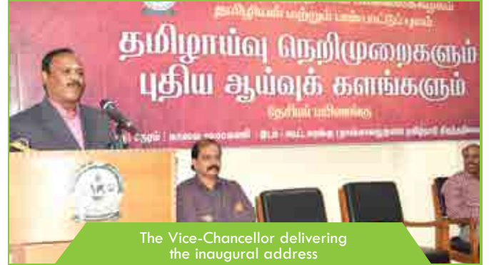
The Vice-Chancellor delivering the inaugural address