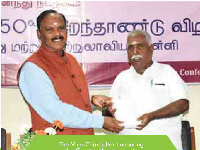
The Vice-Chancellor honouring the Guest with a memento

The 150th Birth Anniversary of Ghandhiji was celebrated in the University on 01.10.2019. The Vice-Chancellor of University presided over the function.