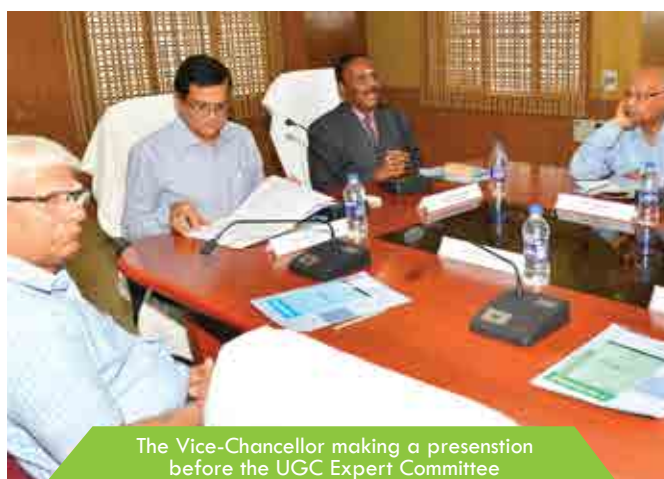
The Vice-Chancellor making a presentation before the UGC Expert Committee