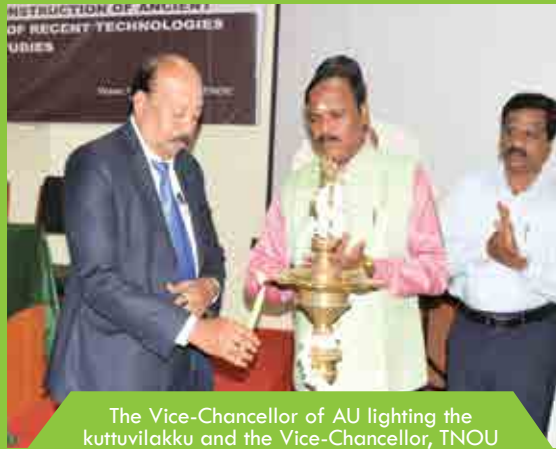
The Vice-Chancellor of AU lighting the kuttuvilakku and the Vice-Chancellor, TNOU paying his respect

The 150th Birth Anniversary of Ghandhiji was celebrated in the University on 01.10.2019. The Vice-Chancellor of University presided over the function.