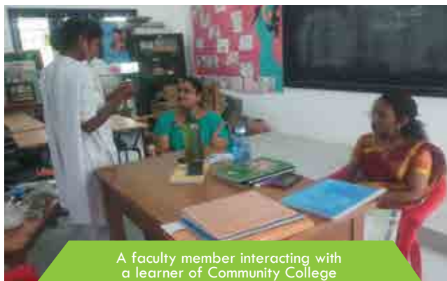
A faculty member interacting with a learner of Community College