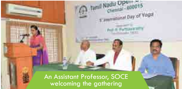
An Assistant Professor, SOCE welcoming the gathering