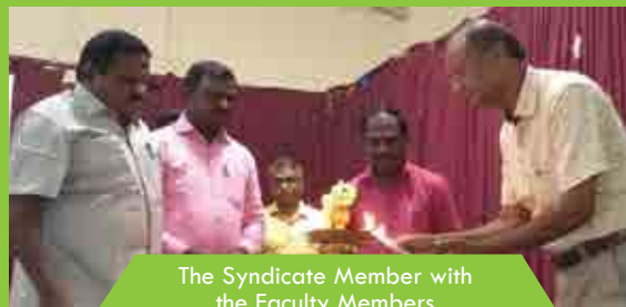
The Syndicate Member with the Faculty Members