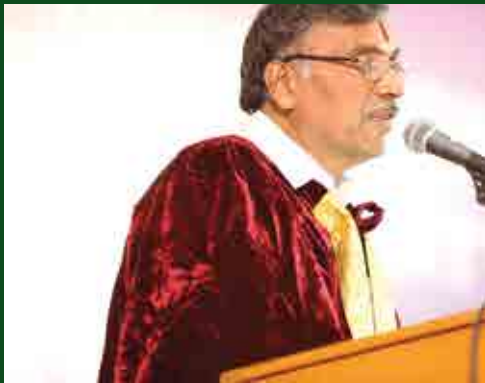
Hon'ble Pro-Chancellor & Higher Education Minister, Thiru K.P. Anbalagan delivering Special Address.