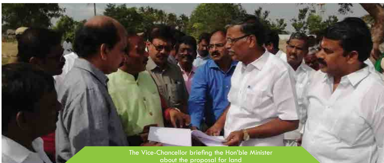
The Vice-Chancellor briefing the Hon'ble Minister about the proposal for land

Hon'ble Thiru. K.P. Anbalagan, Minister for Higher Education, Government of Tamil Nadu and Pro-Chancellor of TNOU visited the alienated land to be allotted for Dharmapuri Regional Centre at Periyannahalli on 10.08.2019.