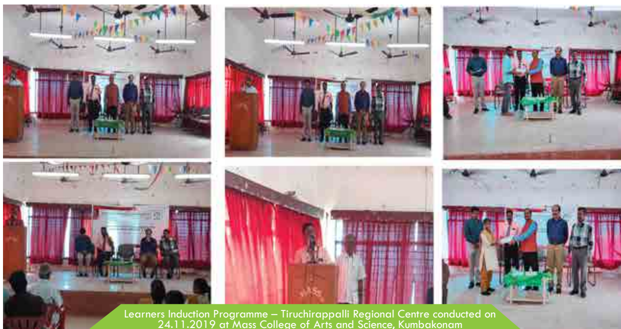
Learners Induction Programme – Tiruchirappalli Regional Centre conducted on 24.11.2019 at Mass College of Arts and Science, Kumbakonam

The second Induction Programme of TNOU for AY 2019-2020 Batch Learners of the region was organised on 24.11.2019 at MASS College of Arts and Science, Kumbakonam.