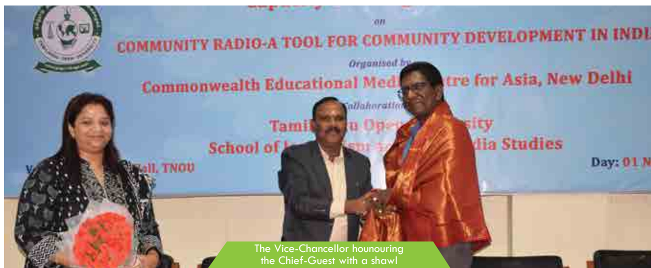
The Vice-Chancellor honouring the Chief-Guest with a shawl