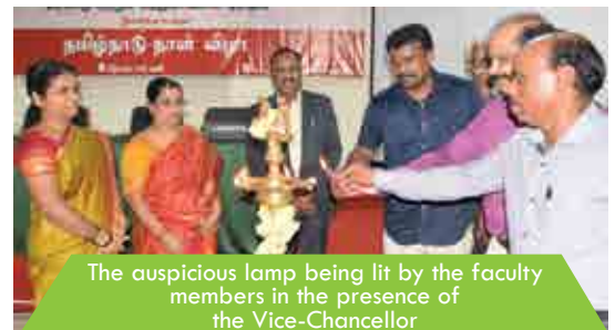
The auspicious lamp being lit by the faculty members in the presence of the Vice-Chancellor