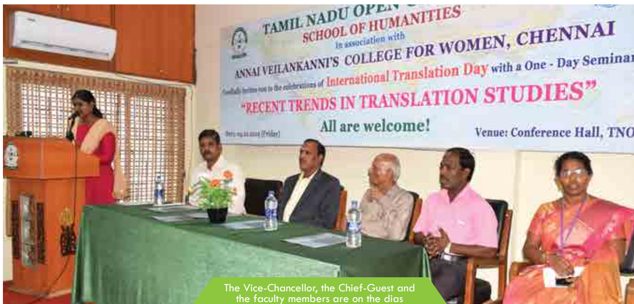
The Vice-Chancellor, the Chief-Guest and the faculty members are on the dais