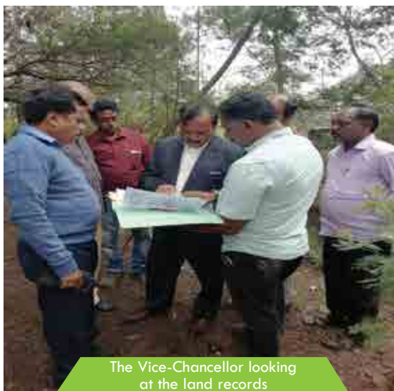
The Vice-Chancellor looking at the land records