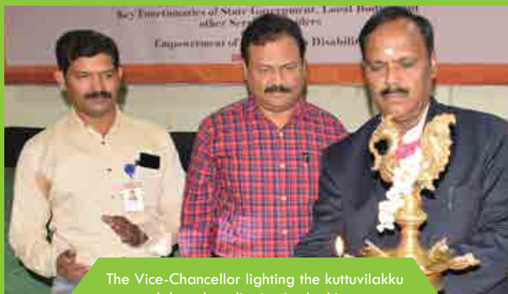
The Vice-Chancellor lighting the kuttuvilakku and the other dignitaries looking on