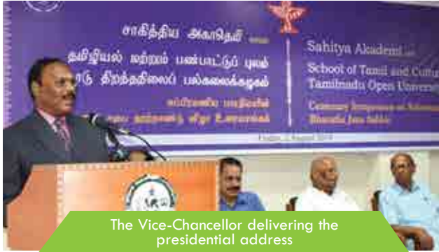
The Vice-Chancellor delivering the presidential address