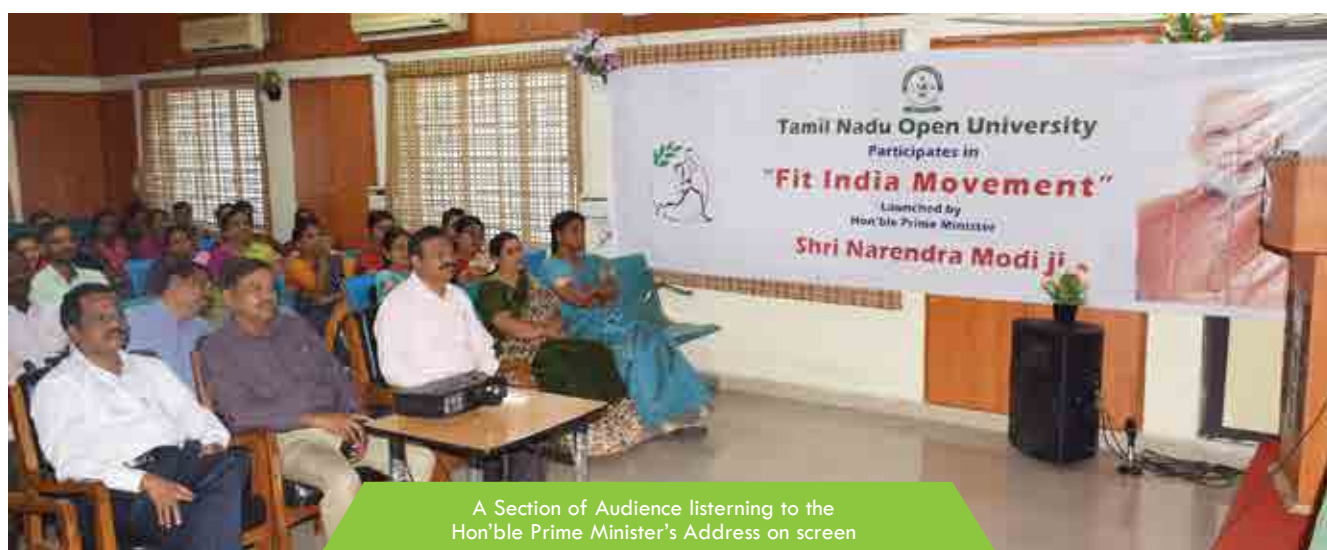
A Section of Audience listening to the Hon'ble Prime Minister's Address on screen

As a mark of celebrating the National Sports Day, Hon'ble Prime Minister of India, Shri. Narendra Modi launched the nation wide “Fit India Movement” on 29.08.2019 at Indira Gandhi Indoor Stadium, New Delhi, live telecast of which was broadcast through video-conferencing. The members of staff of the University participated in the programme at the University premises. As a part of the event, the staff also took part in a walkathon indicating walking is the best exercise. The Administrative Division of the University made the arrangements for the video-conferencing and accordingly, a report of the event was submitted to the University Grants Commission, New Delhi.