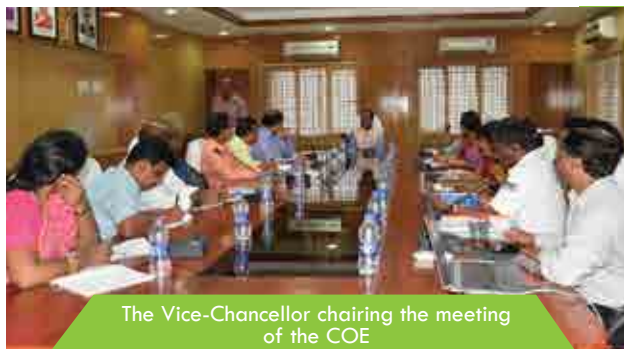
The Vice-Chancellor chairing the meeting of the COE