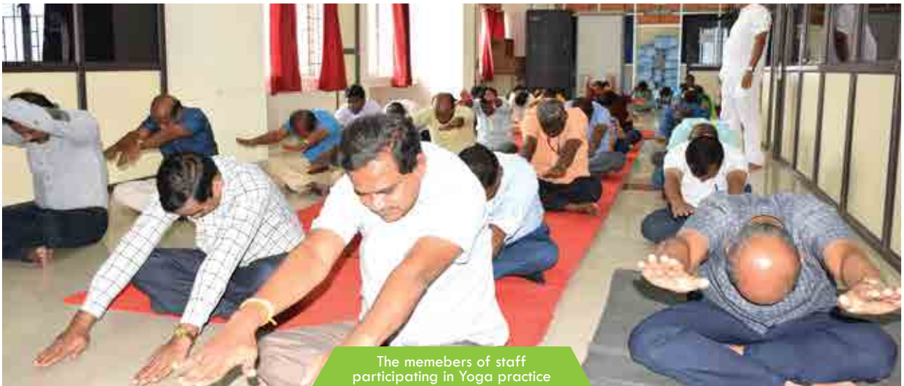
The members of staff participating in Yoga practice