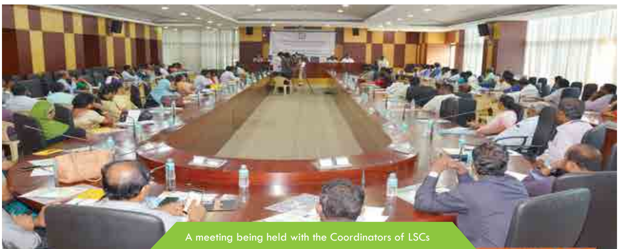
A meeting being held with the Coordinators of LSCs

Further, the Abacus Technology Pvt. Ltd., conducted a demo in the orientation programme regarding online admission process.