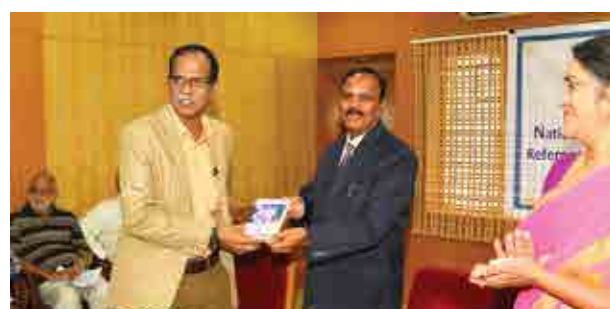
The Vice-Chancellor of TNOU presenting a book to his counterpart at TNDALU