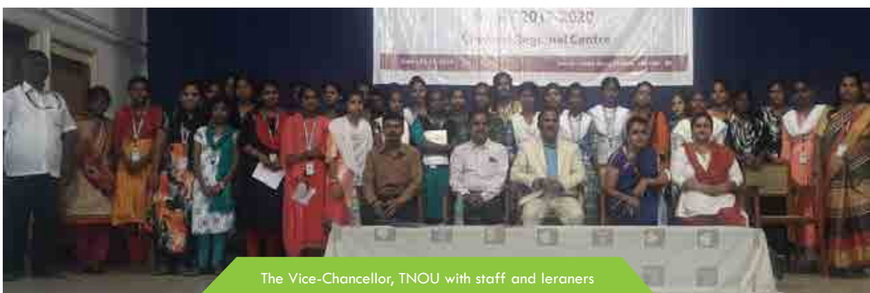
The Vice-Chancellor, TNOU with staff and leraners