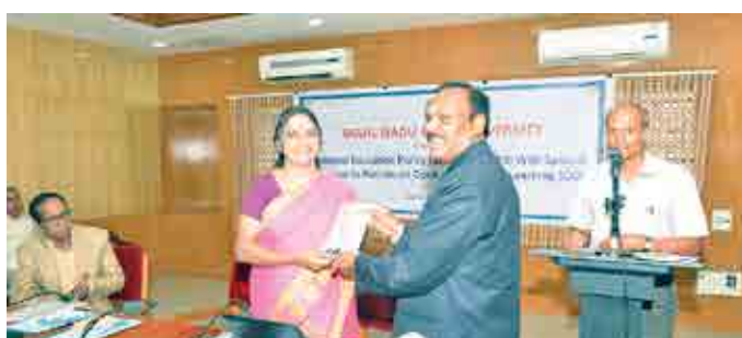
The Vice-Chancellor of TNOU presenting a book to his counterpart at TNMGRMU

Based on the outcomes of the seminar, a consolidated report was prepared and subsequently submitted to the Department of Higher Education, Government of Tamil Nadu and also to the MHRD, Gol for possible considerations in the final NEP.