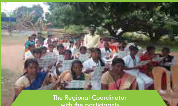
The Regional Coordinator with the participants