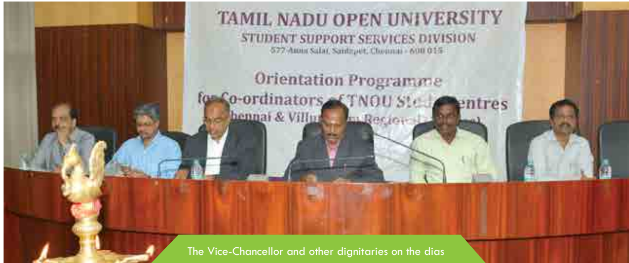
The Vice-Chancellor and other dignitaries on the dais