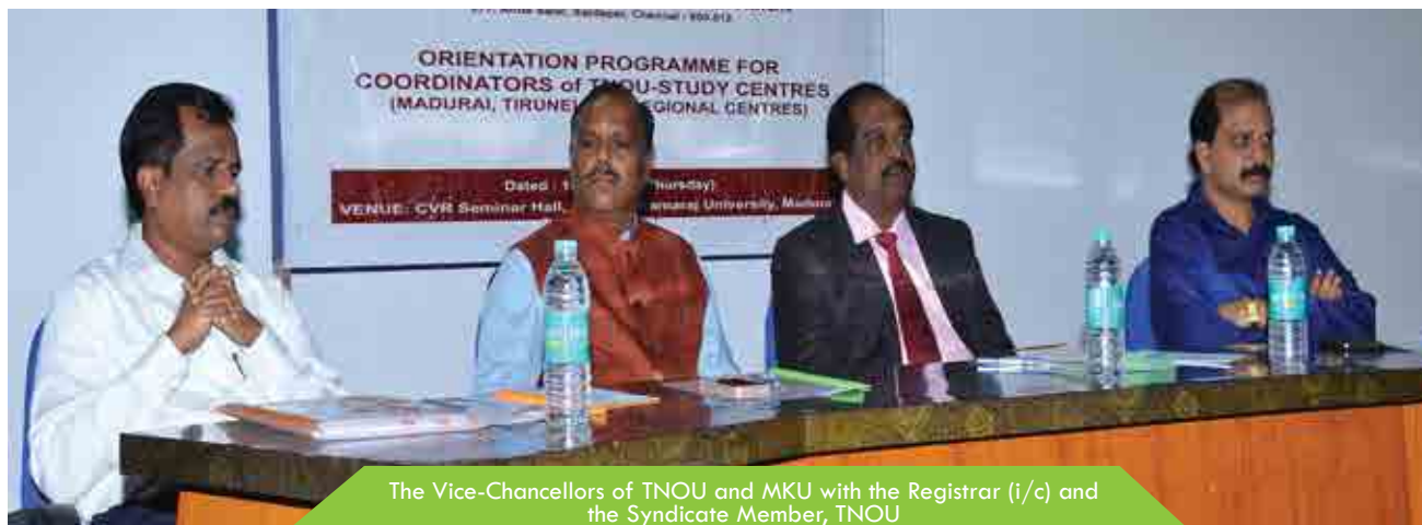
The Vice-Chancellors of TNOU and MKU with the Registrar (i/c) and the Syndicate Member, TNOU

The Orientation Programmes were organized for the Coordinators of TNOU Study Centres together that are under the purview of Madurai and Tirunelveli Regional Centres.