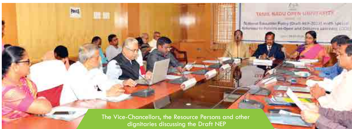
The Vice-Chancellors, the Resource Persons and other dignitaries discussing the Draft NEP

As the Ministry of Human Resource Development (MHRD), Government of India invited the suggestions and comments on the Draft National Education Policy -2019, the University has consecutively conducted the consultation meetings with the staff and the stakeholders with a view to collecting their valuable inputs for the preparation of a complete feedback document on the draft policy.