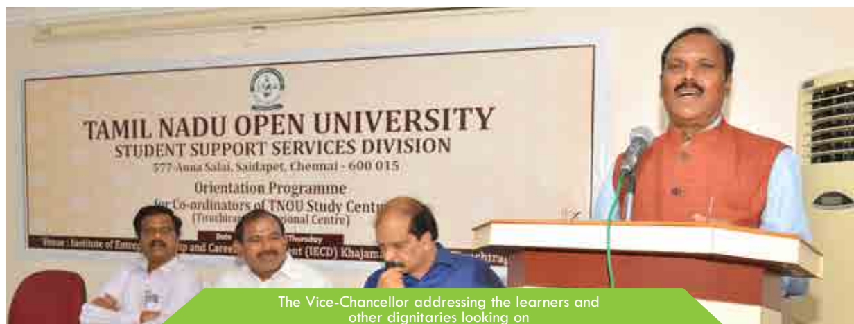
The Vice-Chancellor addressing the learners and other dignitaries looking on