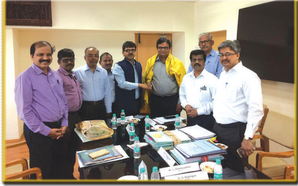
The Principal Secretary and other Syndicate members felicitating the Vice-Chancellor of TNOU during the 47 th Syndicate meeting held on 27-02-2019