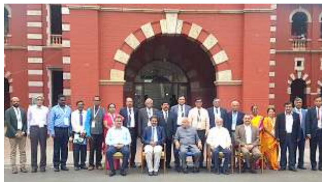
Honorable Governor of Tamil Nadu along with all the Vice Chancellors of State Universities Tamil Nadu during the one day Conference on Startup skills at Anna University held on 10-07-2017

University on 10-07-2017. TNOU took an active part in the event and was the facilitator for the Startup skills for Non-Formal Sector. The Vice Chancellor along with 5 faculties and 20 Community College students participated in the conference. The Honourable Governor of Tamil Nadu and the Vice Chancellors of all the State Universities in Tamil Nadu participated in the conference.