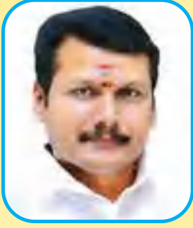
திரு. வி. செந்தில்பாலாஜி மின்சாரம், மதுவிலக்கு மற்றும் ஆயத்தீர்வைத்துறை அமைச்சர்

Thiru R. Sakkarapani Minister for Food and Civil Supplies