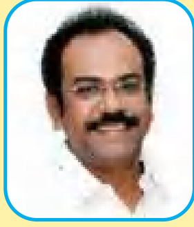
திரு. தங்கம்தென்னரசு தொழில்துறை அமைச்சர் Thiru Thangam Thennarasu Minister for Industries