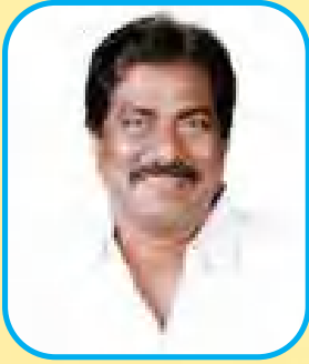
திரு. பி.மூர்த்தி வணிகவரி மற்றும் பதிவுத்துறை அமைச்சர்

Thiru Ma.Subramanian Minister for Medical and Family Welfare