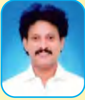
திரு. அன்பில் மகேஸ் பொய்யாமொழி பள்ளிக் கல்வித்துறை அமைச்சர் Thiru Anbil Mahesh Poyyamozhi Minister for School Education