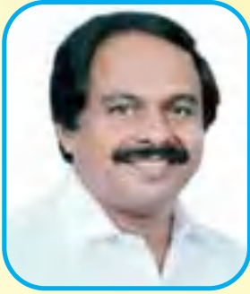
திரு. த. மனோ தங்கராஜ் தகவல் தொழில் நுட்பவியல் துறை அமைச்சர் Thiru T. Mano Thangaraj Minister for Information Technology