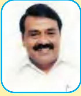
திரு.எஸ். ஆர். ராஜகண்ணப்பன் போக்குவரத்துத் துறை அமைச்சர்

Thiru S.R.Rajakannappan Minister for Transport