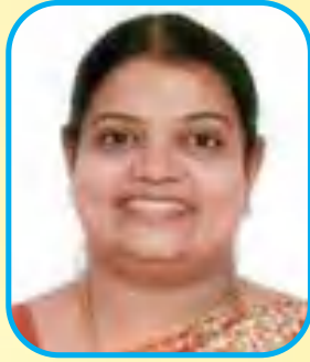
திருமதி. பி. கீதா ஜீவன் சமூகநலம் - மகளிர் உரிமைத்துறை அமைச்சர் Tmt. P. Geetha Jeevan Minister for Social Welfare & Women Empowerment