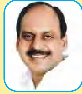
திரு. தா.மோ. அன்பரசன் ஊரக தொழில்துறை அமைச்சர் Thiru T.M. Anbarasan Minister for Rural Industries