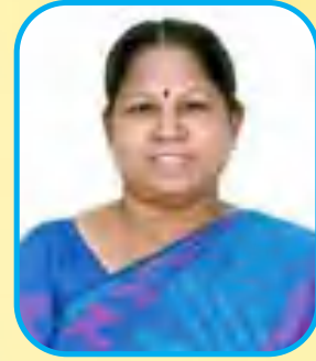
திருமதி.என். கயல்விழிசெல்வராஜ் ஆதிதிராவிடர் நலத்துறை அமைச்சர் Tmt. N. Kayalvizhi Selvaraj Minister for Adi Dravidar Welfare