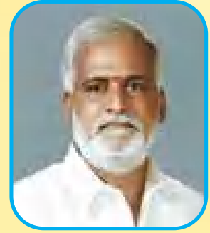
திரு. பி.கே. சேகர்பாபு இந்துசமயம் மற்றும் அறநிலையத் துறை அமைச்சர்

Thiru S.S.Sivasankar Minister for Backward Classes Welfare