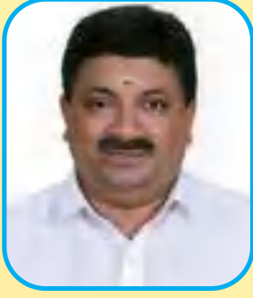
முனைவர் பழனிவேல் தியாகராஜன் நிதி மற்றும் மனிதவள மேலாண்மைத்துறை அமைச்சர் Dr. Palanivel Thiagarajan Minister for Finance and Human Resources Management