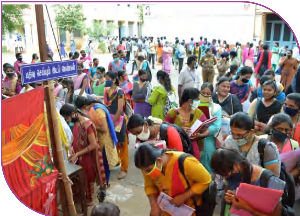
↘ A Section of Candidates Participated in Job Fair

The Student Placement Cell and the Madurai Regional Centre of TNOU jointly organised a Mega Job Fair for the Learners of TNOU and others, in collaboration with the Department of Employment and Training, Government of Tamilnadu at Madura College, Madurai on 23 January 2021. Around 7,000 current and passed out learners of TNOU and other job seekers were informed through SMS and social media to attend the Job Fair, in which more than 100 leading Private Companies took part in the recruitment process.