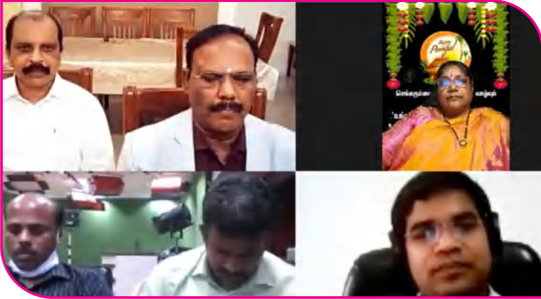
Thiruvalluvar Day Celebration