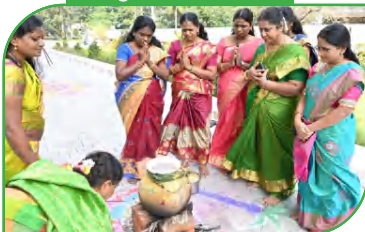
➤ Pongal Celebration in TNOU

The Pongal festival was celebrated at the University on 13th January 2021. All the Teaching and Non-teaching staff of TNOU participated in the presence of Vice-Chancellor and all other syndicate members in the celebration with great enthusiasm.