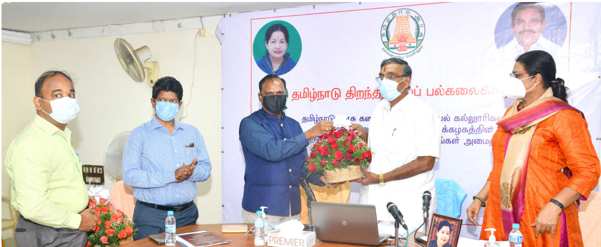
Hon'ble Minister for Higher Education and Agriculture, Thiru K.P. Anbalagan inaugurates....