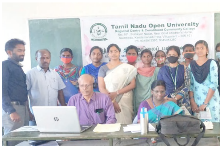
Inauguration of LSC at Villuppuram Region