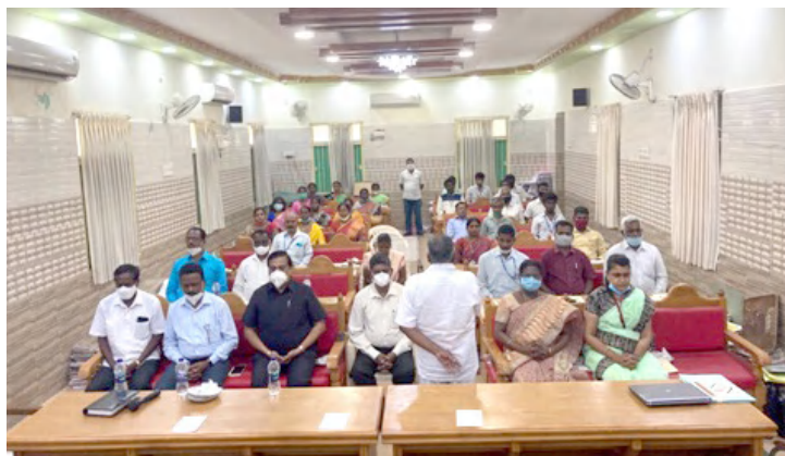
Yoga Training provided by Sky Yoga Foundation