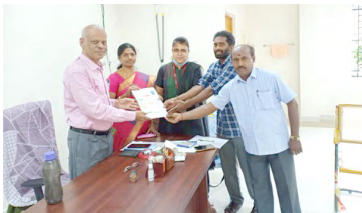
Enrolment of Students at Regional Centre, Villuppuram