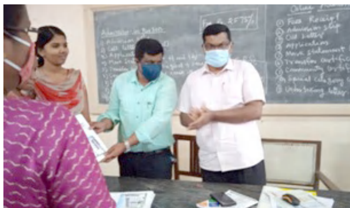
Inauguration of LSC at Government Arts College, Coimbatore