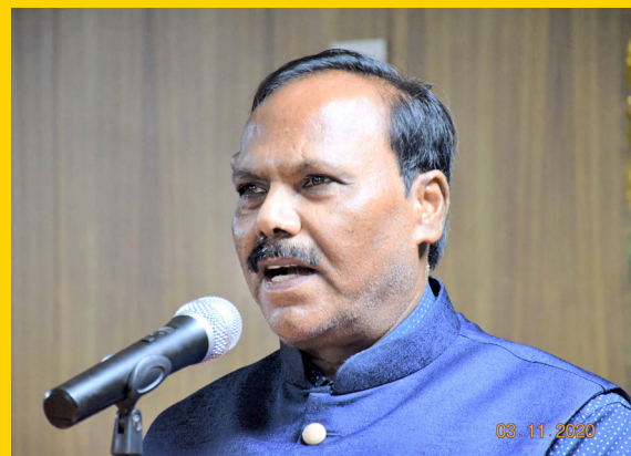
Vice Chancellor Addressing the co-ordinators Meeting...