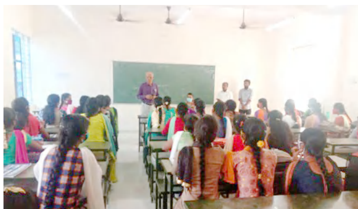
Students of Dr.M.G.R.Arts & Science College attending the Session