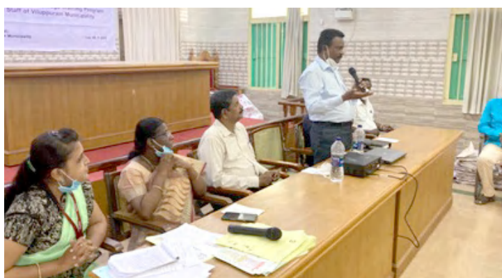
Training Programme for the Staff of Viluppuram Municipality on “Stress Management and Yoga”