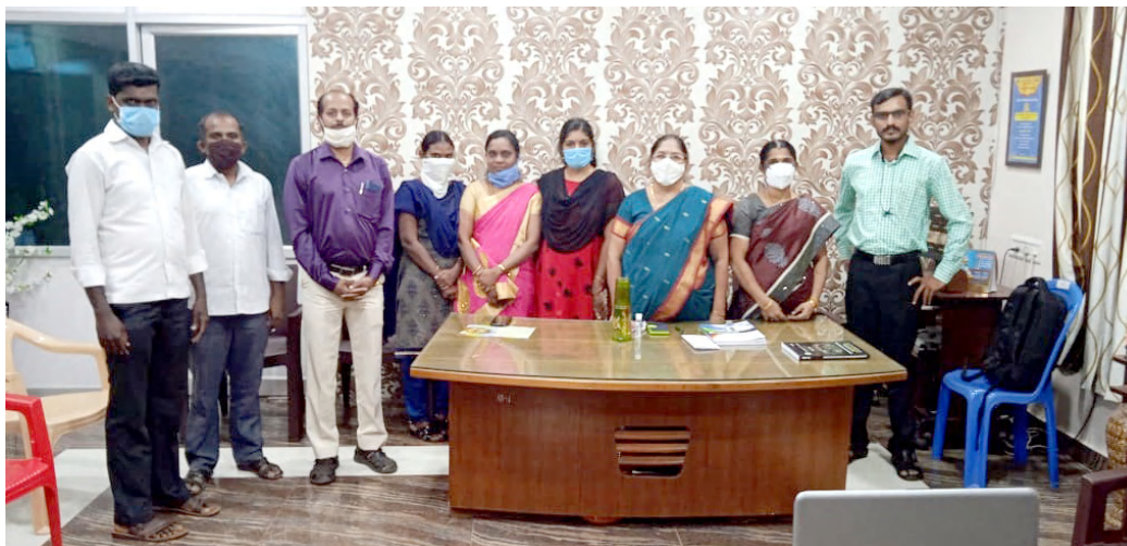
Inauguration of LSC at Government Arts College, Tirunelveli