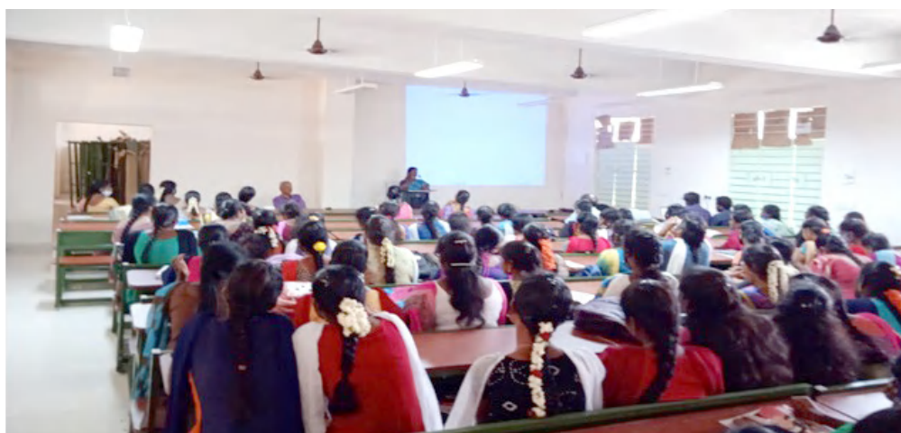
Students of Dr.MGR Arts and Science College for Women attending Seminar